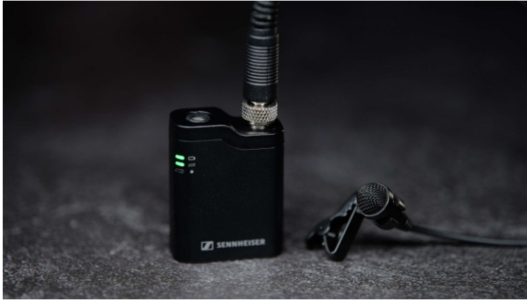
The clip-on mic can also be used as a mini-transmitter for an unobtrusive external lavalier mic

As usual, the clip-on mic can be fitted with an external lavalier mic, creating a very unobtrusive miking solution. Connecting an external microphone will automatically disable the built-in mic.